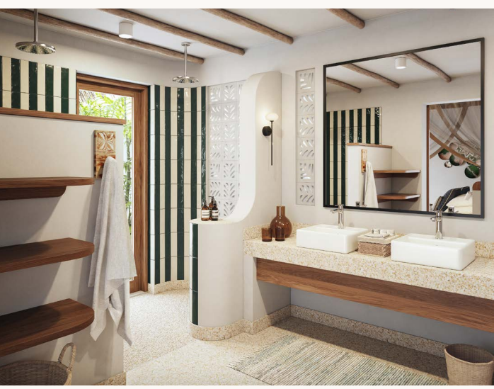
View of the tropical canopy ● Private pool ● 5 minutes' walk from the beach ● Double walk-in shower