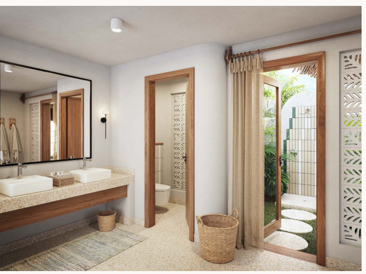
5 minutes' walk from the beach • Direct access to a shared infinity pool • Outdoor shower